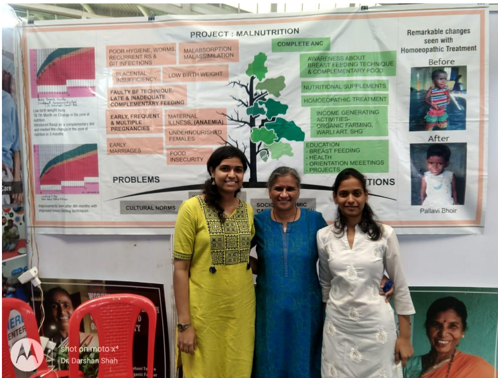
World AYUSH expo 2019: case presentation, poster presentation: presenters and winners