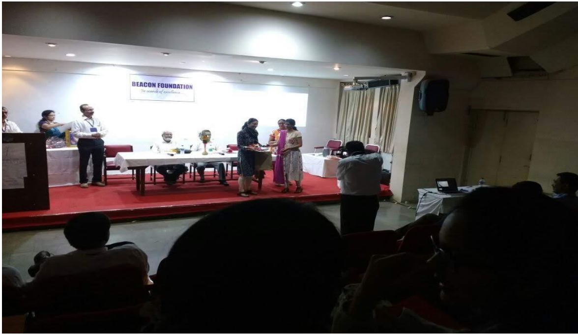
Becon competition case presentation winner 2018