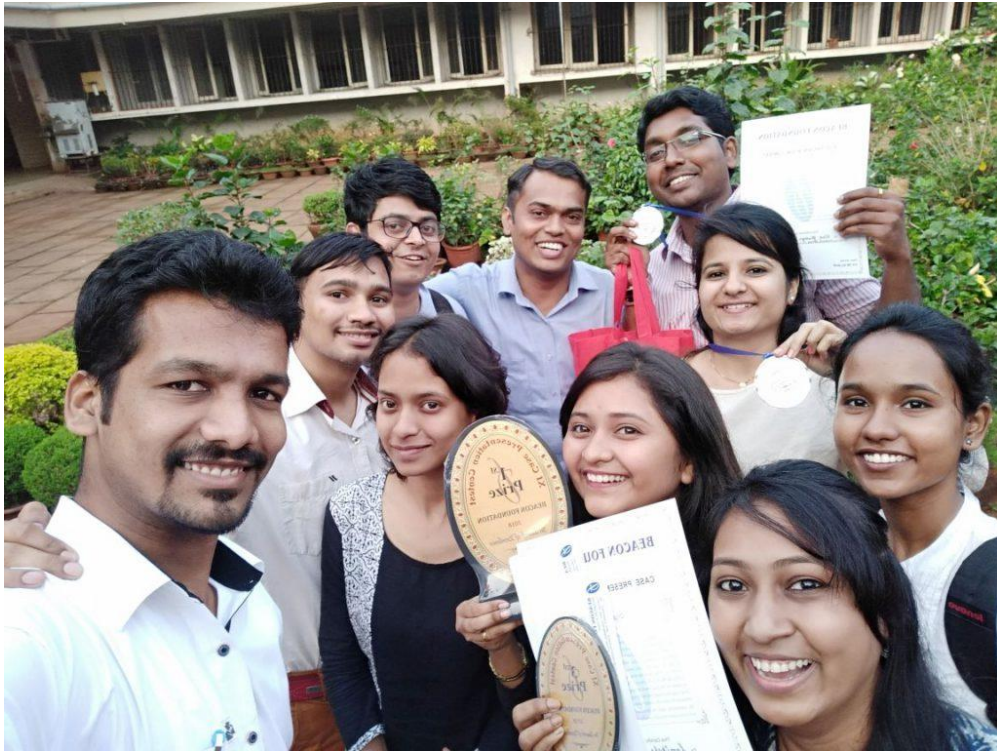
Becon national level case presentation competition 2018: participants and winners